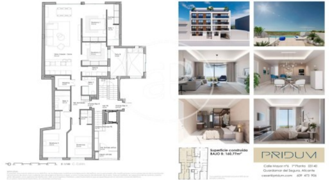
EDIFICIO COLÓN 24-26

The information about any property is not binding to any offer or contract. Any verbal or written declaration made by aProperties with regards to the value or condition of the property should not be considered accurate or factual. The pictures make reference to some parts of the property at the times that they were taken. The areas, dimensions and distances that are given are approximate and should be checked by the client. The images are computer generated and are just an approximate indication of the real appearance of the property; these may change at any time. The information with regards to the property may also change at any time.